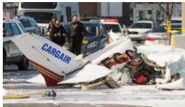
One of the planes came to rest in the parking lot of a shopping centre on Montreal's South Shore.