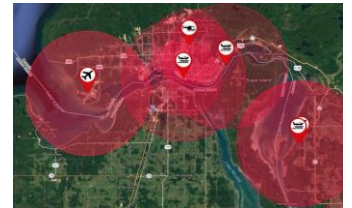
Screenshot of National Research Council Canada's UAV site selection map for Sault Ste. Marie. Areas in red show where flight is restricted to recreational drone operators.

Welcome to a no drone zone. New federal rules that restrict recreational drone users from flying within 75 metres of buildings, vehicles and people effectively eliminates their use within the city for recreational users.