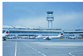
"Airports, like Pearson, are natural monopolies," writes David Macdonald. "Whoever operates them has no real competition because it's just too expensive to build several international airports in Toronto."

PICKLE LAKE -- A North Star Air BT-67 cargo aircraft was forced to make an emergency landing at the Pickle Lake airport on Friday. Ontario Provincial Police officers were called to the airport at 12:20 p.m.