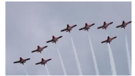
Canadian Forces Snowbirds are scheduled to fly at the first Windsor airshow in years.