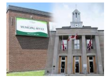
Cavan Monaghan Township office and Peterborough City Hall

Air Canada (AC) will increase its current Comox-Vancouver service of two flights per day to four flights in preparation for the summer season. The extra capacity resulting from the service addition is well timed to meet YQQ's peak summer demand.