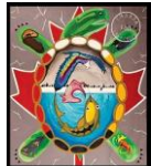
Seven students at Urban Aboriginal School created a mural to celebrate Canada's 150th birthday.

Windsor's first airshow in years is the result of popular demand, according to organizers of the event coming up in May. Airshow YQG was officially announced Friday by members of the Canadian Historical Aircraft Association and members of the airshow planning committee.