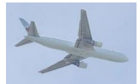
There's still time to comment on airplane noise

Oakville residents have until Friday, March 31, to provide comments or feedback on the issue of airplane noise in town. Helios, an aviation consultancy hired by Nav Canada to conduct an independent review of Toronto airspace, held a community consultation on Thursday, March 2, at St. Luke's Community Centre.