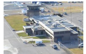
An aerial view of the Penticton Regional Airport.

Close to a million dollars has landed at the Vernon airport thanks to the B.C. government. The latest of a flurry of funding announcements from the ruling BC Liberal Party has the airport receiving $823,700 in funding from the B.C. Air Access Program this year for runway rehabilitation.