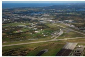
Aerial shot of the Yarmouth International Airport