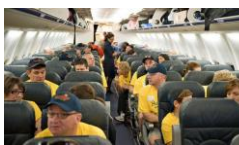
Volunteers and participants wait aboard a plane for a flight to Disney World in Florida for the 2011 Dream Lift.

Under sunny skies government officials helped open the brand new $7.1 million Cariboo Fire Centre at the Williams Lake Airport Thursday. Built by Lauren Brothers Construction of Williams Lake, the new centre’s buildings replace 11 separate structures and trailers, some which were 40 years old.