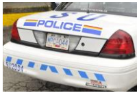
A six-year-old boy kept 911 dispatchers busy for about 40 minutes with false reports. File photo

Wednesday's federal Liberal budget won't announce plans to sell off Canada's major airports, even though such a move could raise billions in one-time revenue for a government that has little room left for new spending. The Globe and Mail has learned that, while the issue of airport privatization will continue to be debated inside government, it will not be resolved in this week's budget.